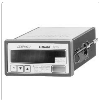
GEMÜ 1275 Digital display unit with or without switch points Panel mounting acc. to DIN 43700-96x48 Note: The mounting bracket is supplied with the unit as standard.

Separate data sheets are available for the above accessories upon request.