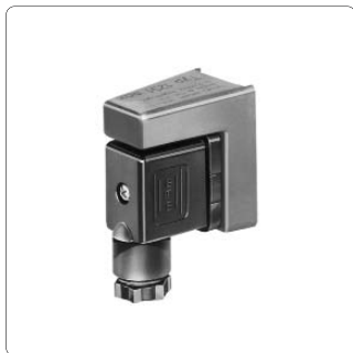
GEMÜ 1251 Limit switch (max) (Switching duty of magnetic switch 10 VA)

To increase the versatility of the GEMÜ 800 flowmeter, numerous accessories have been developed which can be retrofitted onto the tube without modification. The float, however, must be one containing a magnet, in order for these accessories to function.