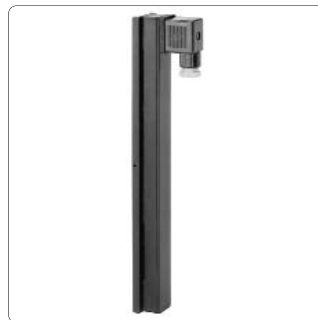
GEMÜ 1270 Instrument sensor for continuous flow readout (resistance 0-10 kΩ)